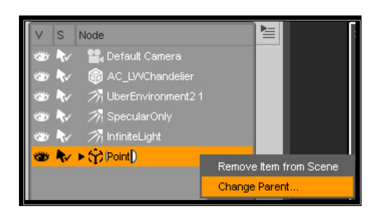
Step 5: In the dialog box that pops up select the light prop that you are parenting the null to and click on accept.