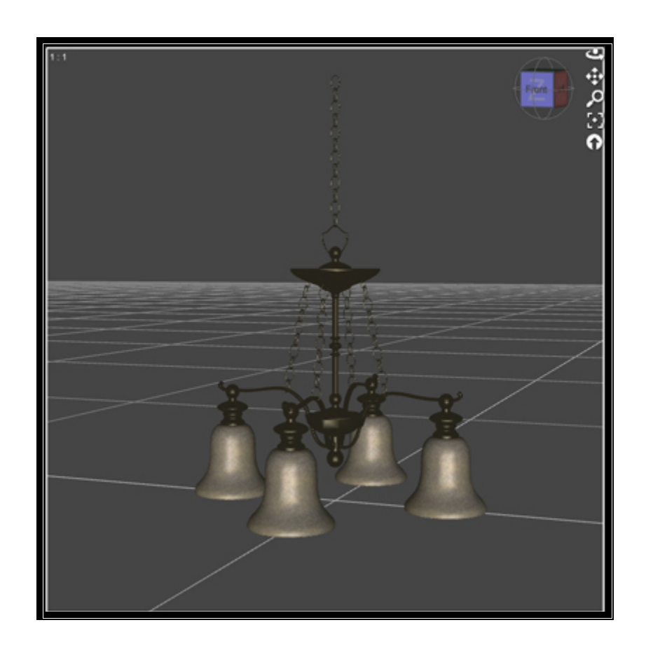
Step 2: Add the DAZ Studio mat setting from the pose library (suggest using the "Light On" ones).

Step1: Load in the light prop of your choice from the prop library.