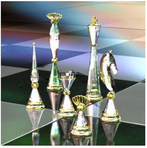
Ambient at 400%