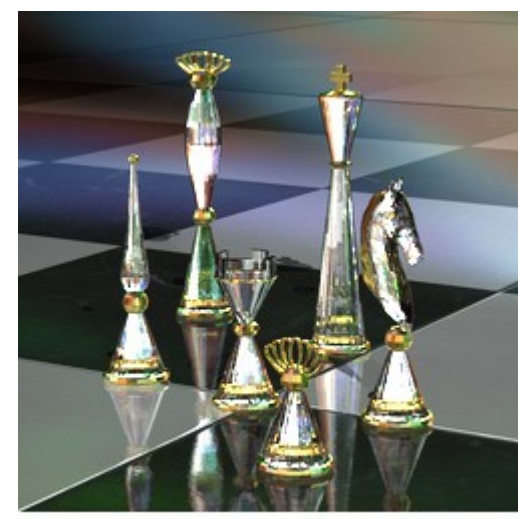
Ambient at 250%