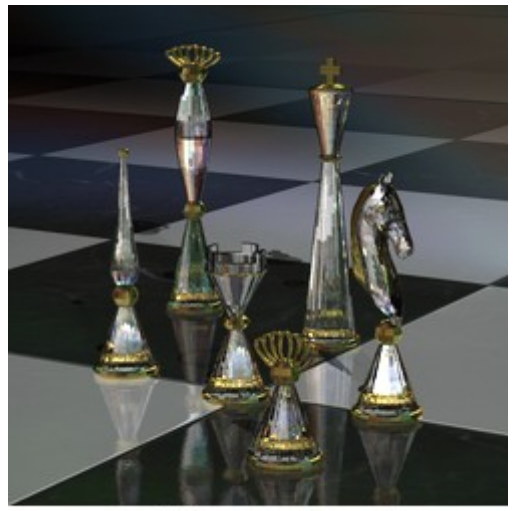
Ambient at 100%

When the materials load the ambient will be set to 250% which is good if you have other things in the scene that are obscuring parts of the prop from being reflected. Be aware however that to some extent the ambient reflections act almost like additional lighting in the scene.