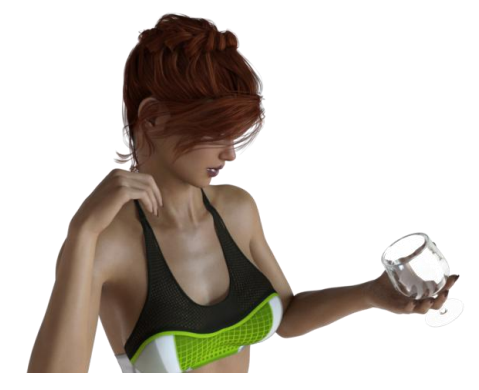
Figure 6 - Move Everything 100%

The Adjust Eyes Independently option controls whether the script adjust each eye separately to look at the node. When the last selected item is too close to the figure,