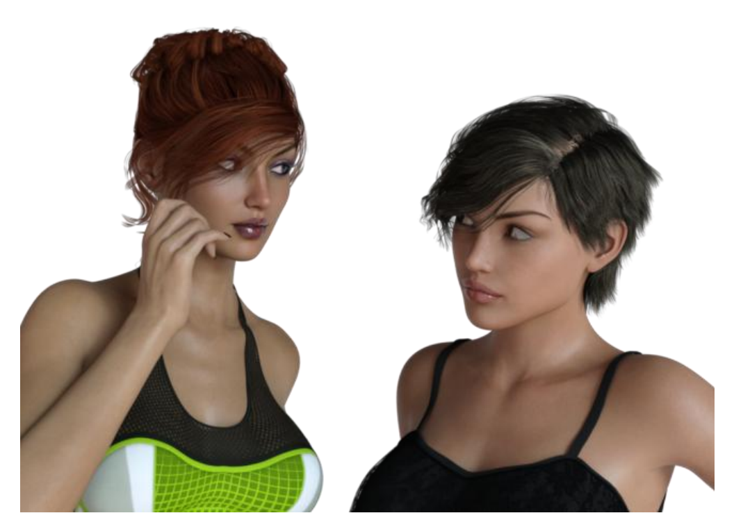
Figure 11 - This pose is more interesting. The Left Figure's head bend is 100%, twist 30%, and side to side 50%. The Right Figure's head bend is 100%, twist 0%, and side to side 50%.