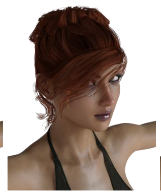
Figure 3 - Move Eyes Only 100%