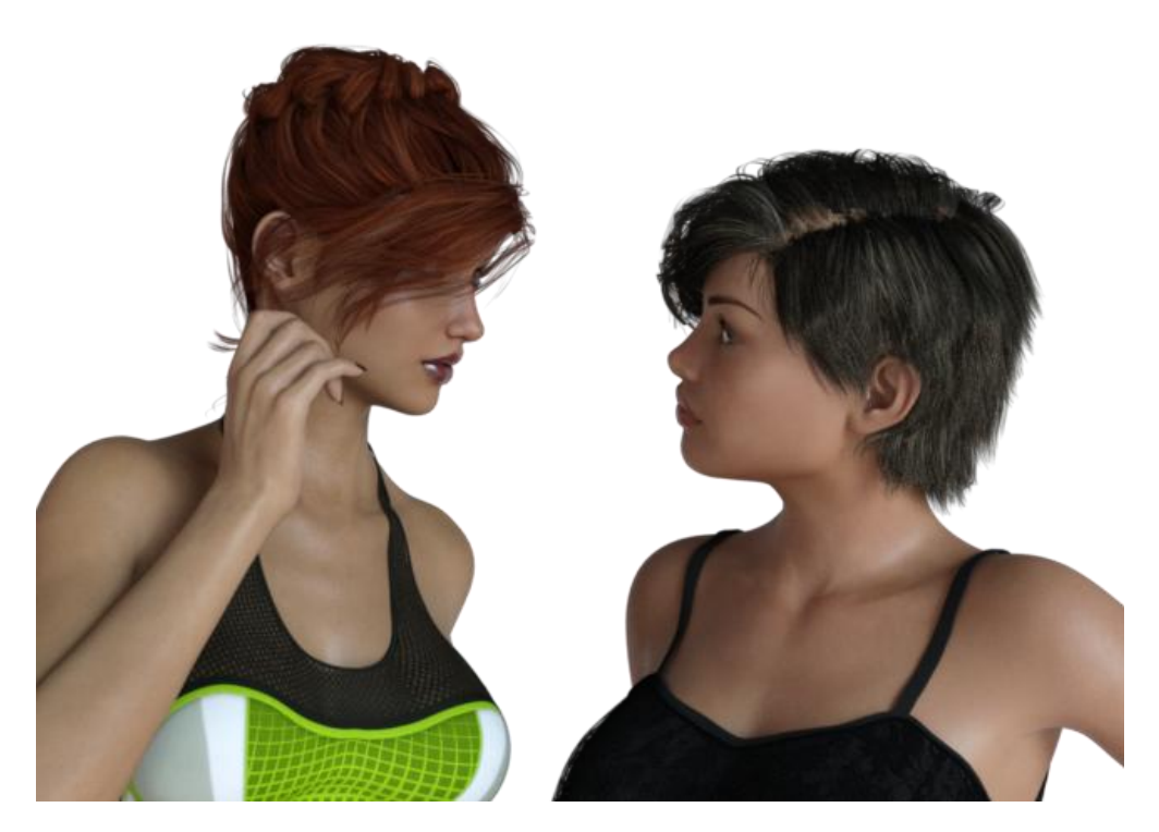
Figure 10 - Both Figures have moved everything 100%