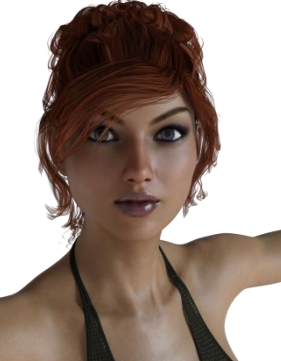
Figure 2 - Move Everything 100%