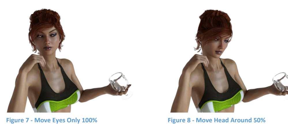
Figure 5 Move Eyes only 200%

The Toggle Head Movement and Toggle Eye Movement buttons toggle all head sliders (or eye sliders) between 0% or 100% each button press.