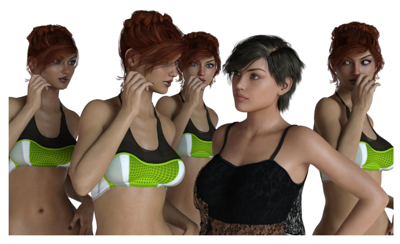
Figure 12 - All of the woman in the green top have been posed so that everything looks at the last character's eyes. The last selected figure is the woman in black.