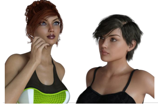
Figure 9 - Starting Poses 6 | Page

The Toggle Head Movement and Toggle Eye Movement buttons toggle all head sliders (or eye sliders) between 0% or 100%.