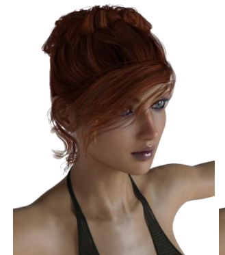
Figure 1 - Starting Pose

The Adjust Eyes Independently option controls whether the script adjust each eye separately to look at the camera. When the camera is too close to the figure, this can give a cross-eyed effect. If this option is off, the script uses a point between the eyes to calculate the direction to look and moves both eyes using this direction.