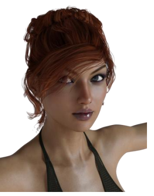
Figure 4 - Move Head Around 50%